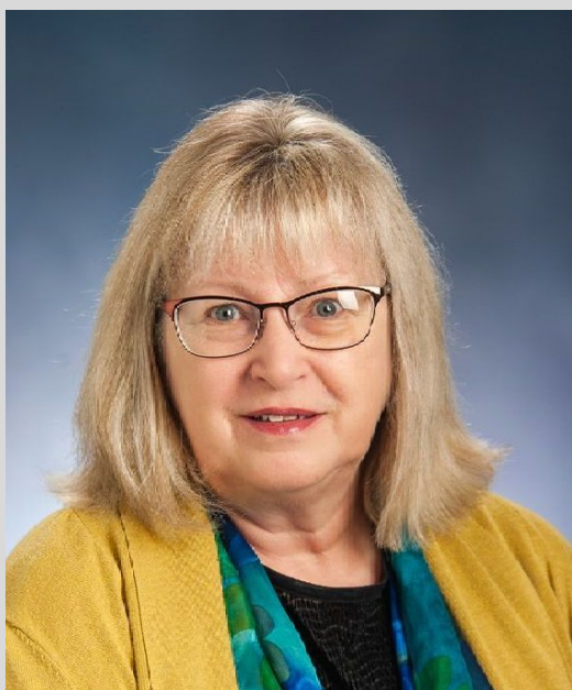
NABA-DFW Outstanding Faculty